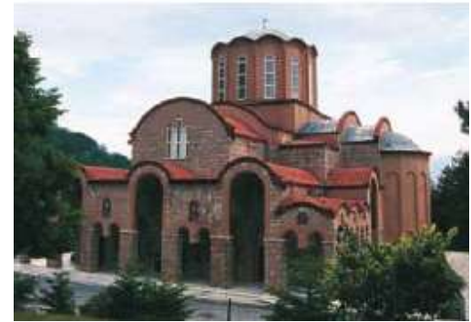
Monastery of Panagia Olympiotissa

Circa 50 AD, the Apostle reached Corinth where he stayed for 18 months. The ancient monuments, the Byzantine churches and monasteries are the city's main tourist attraction. During his 3rd journey, Paul visited Lesbos, Chios and Samos, three beautiful North Aegean Sea islands.